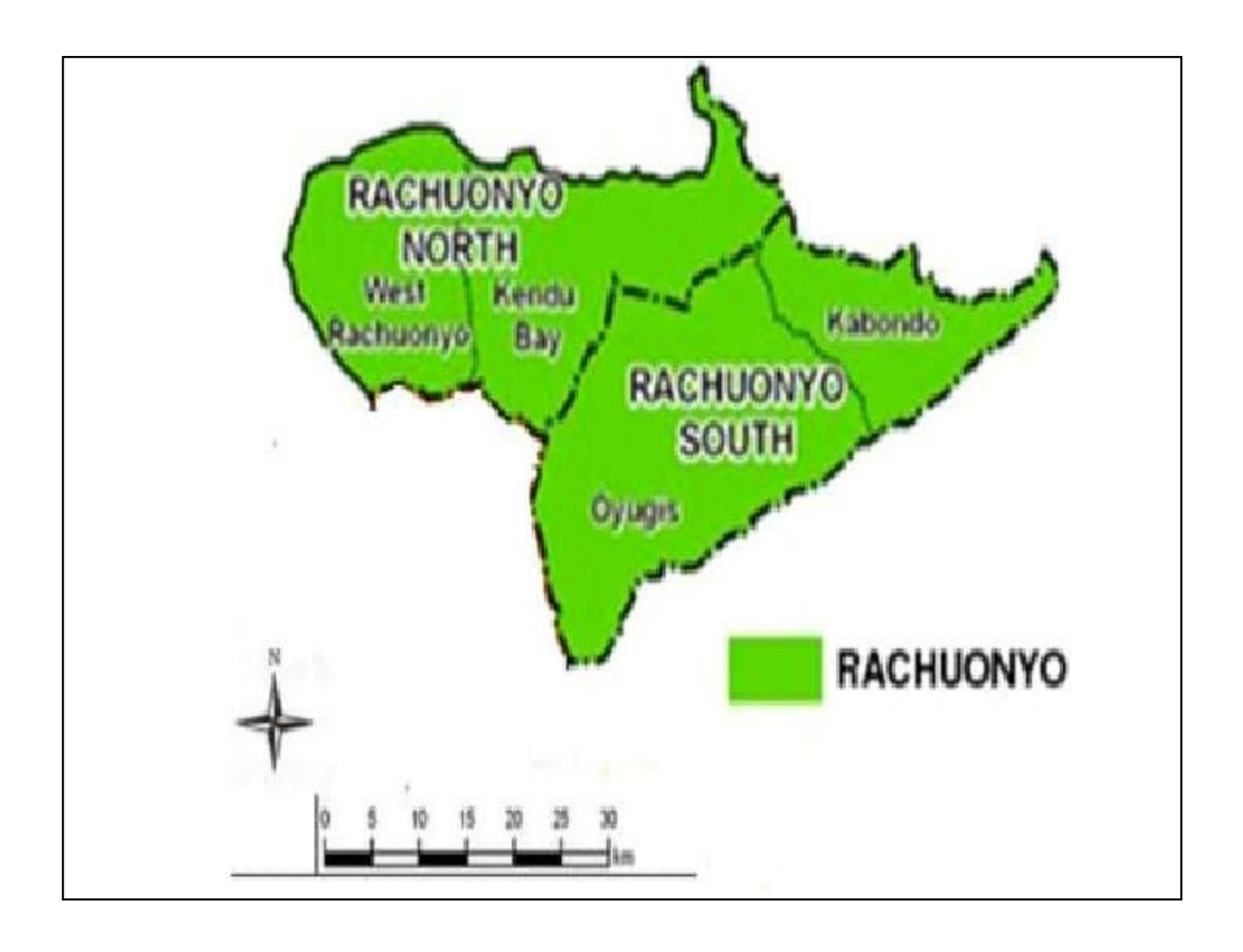
APPENDIX 11: MAP OF RACHUONYO NORTH SUB-COUNTY