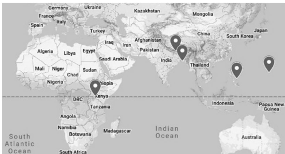
Figure 1. Map showing the location of the five case study sites

Source: map data © Google 2019; markers showing the five case study sites added by the authors.