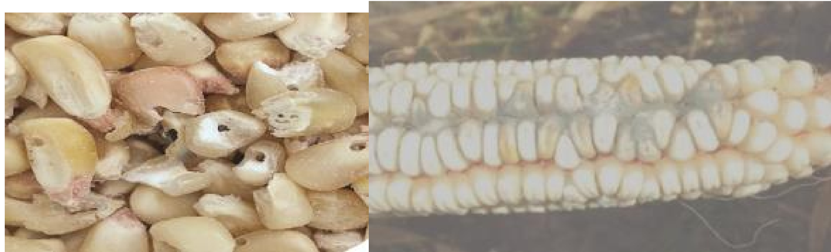
Causes of postharvest losses

In 2022, Maseno University collaborated with the University of Maryland Eastern Shore (USA) through the Feed the Future Innovation Lab for Current and Emerging Threats to Crops (CETC-IL) project to survey and analyze post-harvest losses in maize production in Kisumu and Siaya counties, Kenya.