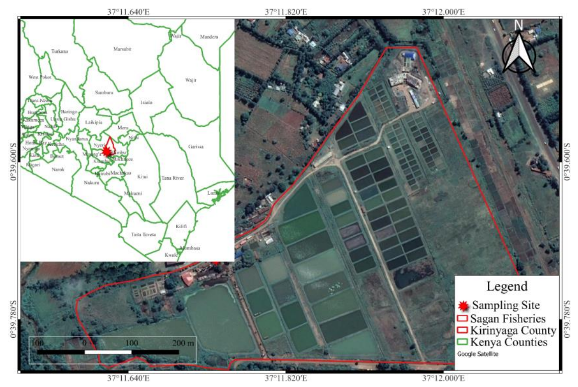
Figure 1. The National Aquaculture Research Development and Training Center, Sagana (Experimental site)