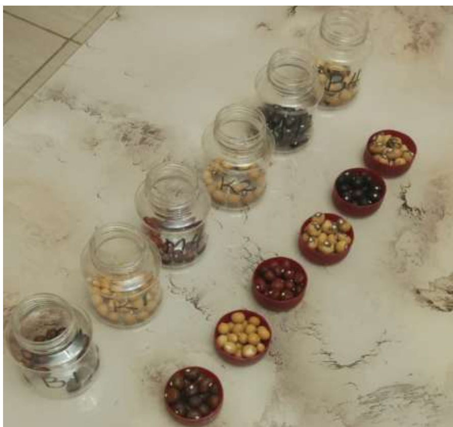
Figure 2. The seed testa pattern and seed testacolor of the six Bambara groundnut germplasm used in the study.