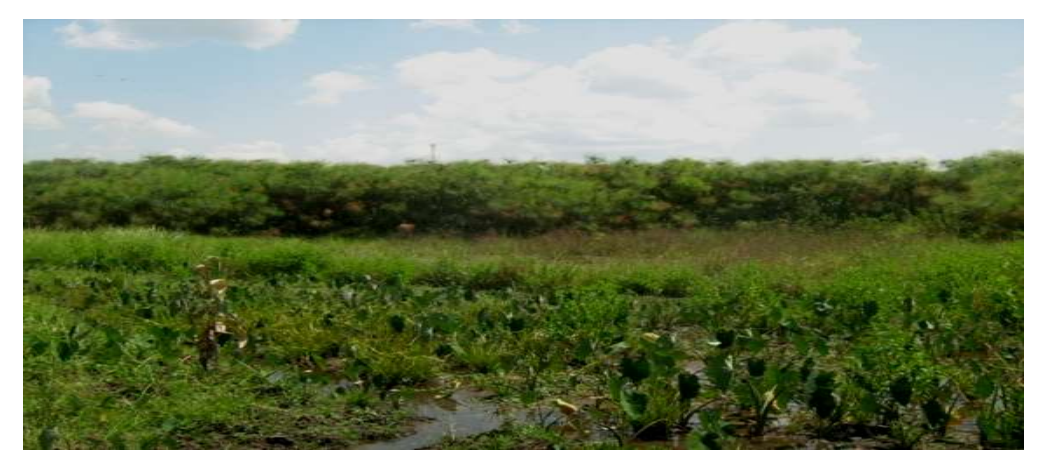
Neranda Swamp in Mayenje sub-location reclaimed for growing of arrowroots and maize

Observation also revealed that the study area is well covered by a variety of swamps which support a variety of plants and animal species; including Neranda swamp, Munongo swamp and Sango swamp. Many of the bird and animal species like Harlequin quail. Antelopes, weaverbirds, and Egrets utilize the wetlands as sources of food, water, nesting materials or shelter. Migratory water birds also rely on the wetlands for nesting areas, feeding and breeding grounds. Munongo and Sango wetlands are productive ecosystems that contribute ecologically, socially, and economically to the people of the study area (Republic of Kenya, 2003). The respondents interviewed suggest the need to establish protected areas in the division to conserve these valuable species and this could benefit the community and the County The continued need for farming land has led to encroachment on the wetlands in the study area. Wetland like Neranda swamp has been reclaimed for growing crops such as maize, yams and beans as shown in the plate below.